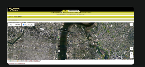
System Dashboard Overlay Review and access alarms, power failures, communication problems, and RTU status from a map overlay.

Program your unit's alarm conditions from AlarmAgent.com. Set notification groups, channel trip delays, and even scale your analog measurements without being in front of your unit.