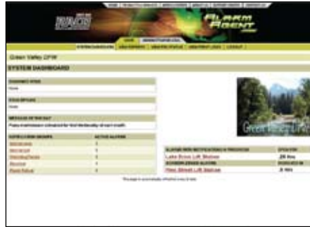
System Dashboard Screen Review and access alarms from a single screen.

AlarmAgent.com’s user-friendly, web-based interface puts everything you need right at your fingertips. The easy-to-use control panel allows you to access WRTU status, notification order and contact preferences, alarm activity (even across multiple stations) and details of alarm acknowledgment activity. And no additional software is required.