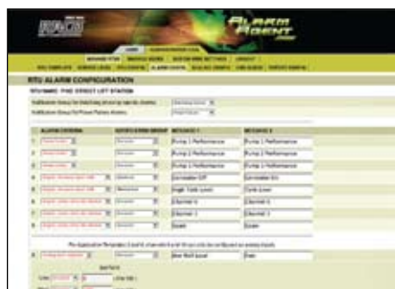
WRTU Channel Configuration Screen Reconfigure channels in seconds.

AlarmAgent.com provides extreme flexibility for custom configuration. Add stations. Change alarm parameters. Manage users and update their notification preferences. All this functionality and more is possible through clear instructions and drop-down menus that allow you to manage your selections in just seconds.