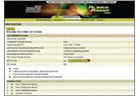
WRTU Status Screen Get the complete status of your WRTUs anytime.

report — Generate comprehensive reports on-demand with just the click of a mouse.