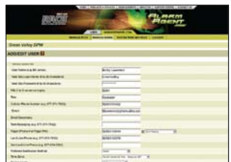
Add a User Screen Easily change user permissions and preferences.